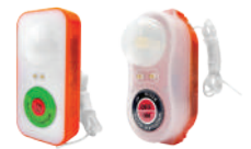
Life Jacket Lights Model: HXYD-GD, HXYD-L-B