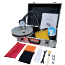
Test & Repair Kit for Immersion Suit