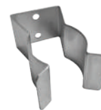
Stainless Steel Clip for Lifebuoy Light