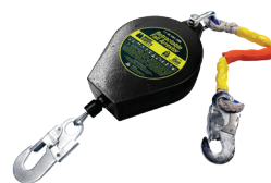
Fall Arrestor Device 5m/10m/15m/20m/25m/30m