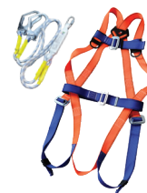
5 Point Fall Arrest Safety Harness Set