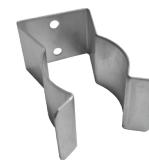
Stainless Steel Clip for Lifebuoy Light