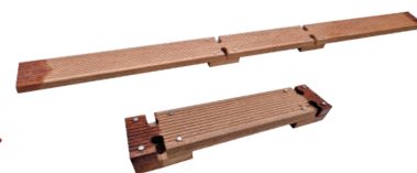
Hardwood Replacement Steps