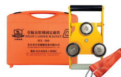
Holding Magnet Model: HX-300