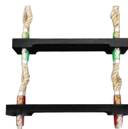
(2) Closed End Type

Note: If none is chosen, we will proceed with option 2 (Closed End) which is more common.