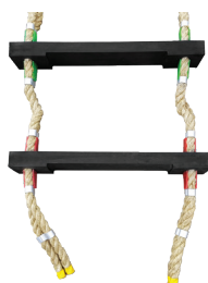
(1) Open End Type