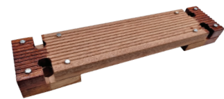
Hardwood Replacement Steps